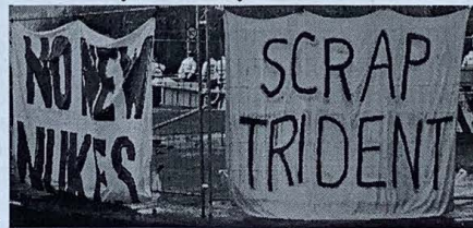
Faslane November 2006