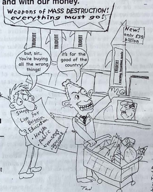
graphic: Tad Davies